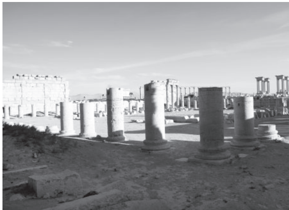
Figure 1 - The graffito from the Palmyrenian Agora.