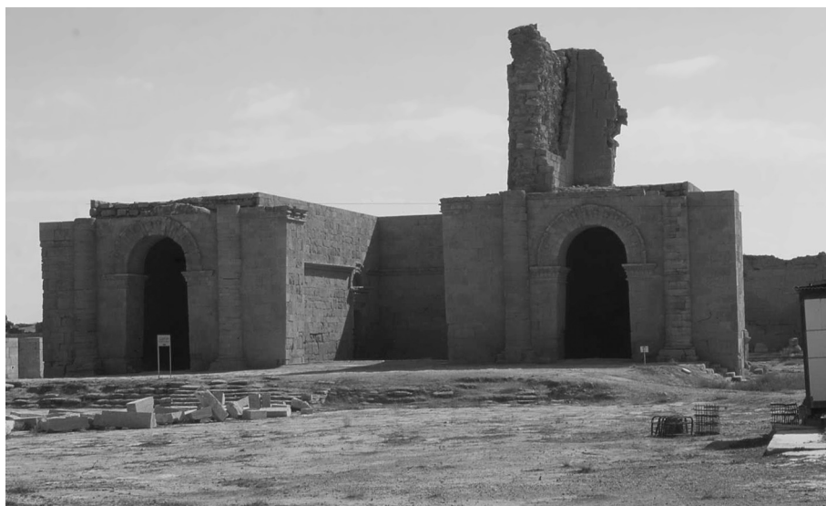
Fig. 3: Iwan of Trinity from the southern part of the temenos. (K. Jakubiak)