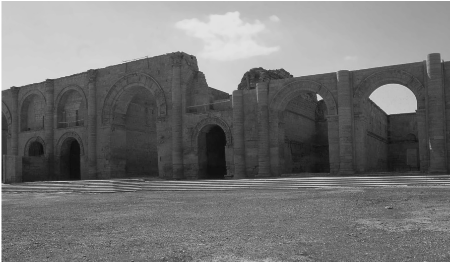
Fig. 4: Great Iwans. (K. Jakubiak)