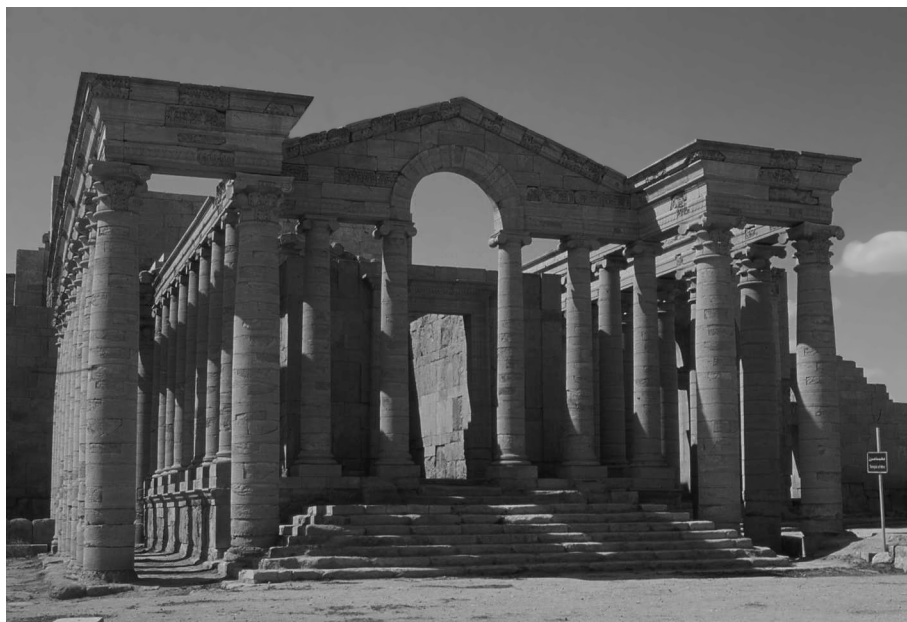
Fig. 2: Temple E in the eastern part of the temenos. (K. Jakubiak)