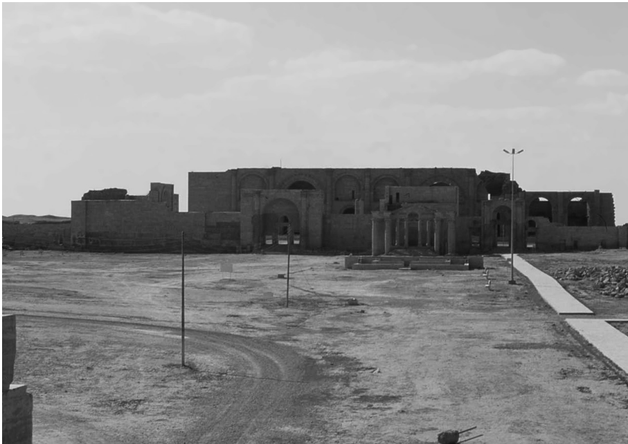
Fig. 5: Main Sanctuary – view from the east. (K. Jakubiak)